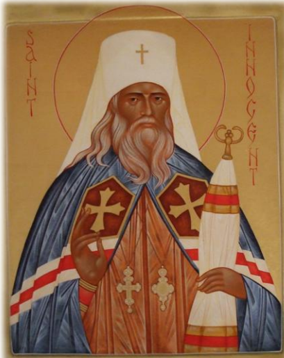
◊ Holy St Innocent, pray to God for us!

St. Innocent is also commemorated on March 31, the day of his repose. He died on Holy Saturday of 1879 and had his desire to be buried during Bright Week fulfilled. Having obeyed the will of God all his life, and not wanting any flowery eulogies given at his funeral, he left behind a theme for the sermon to be preached at his funeral: "The steps of a man are from the LORD, and he establishes him in whose way he delights" (Ps 36/37:23).