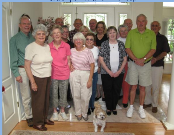
A fall afternoon 'small group' gathering of some of the St John of the Ladder members and friends.